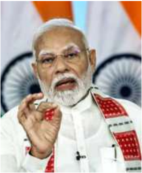
Prime Minister Narendra Modi

“(We've moved) from a time when our forces faced critical equipment shortages to an era of self-reliance today — this is a journey that every Indian can be proud of,” Prime Minister Narendra Modi said on Wednesday, hailing the growth in the defence sector.