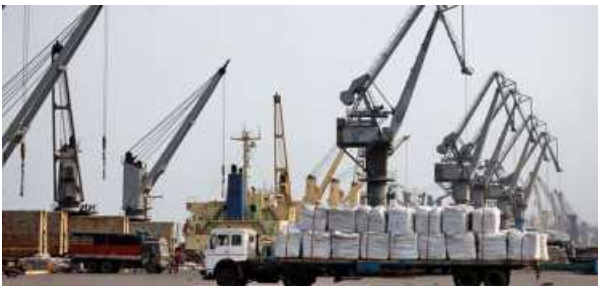
GREEN AMBITIONS. Kandla port aims to host 5.5 mtpa of green hydrogen producing units by 2030-31