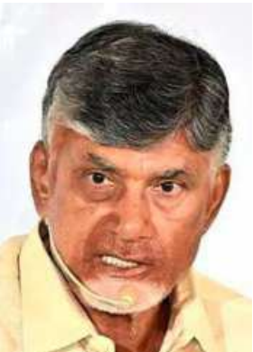
Andhra Pradesh Chief Minister N Chandrababu Naidu

With balanced regional growth as one of its objectives, the vision document has been prepared to take the development activity down to the district/constituency level, the Chief Minister said.